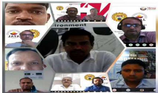
[Eminent Speakers- ATAL FDP]