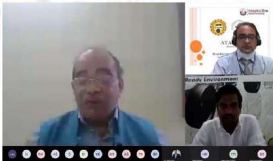
[Address by Hon'ble Chief Guest]