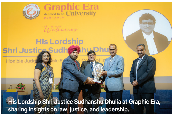
His Lordship Shri Justice Sudhanshu Dhulia at Graphic Era, sharing insights on law, justice, and leadership.