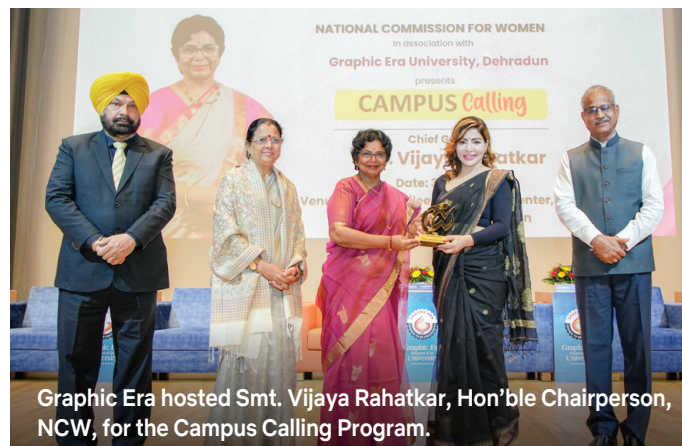
Graphic Era hosted Smt. Vijaya Rahatkar, Hon'ble Chairperson, NCW, for the Campus Calling Program.