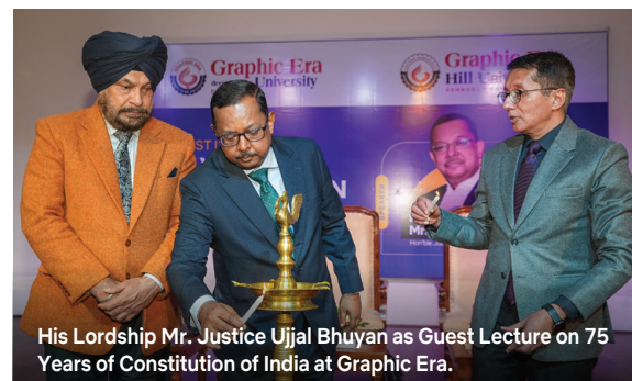
His Lordship Mr. Justice Ujjal Bhuyan as Guest Lecture on 75 Years of Constitution of India at Graphic Era.