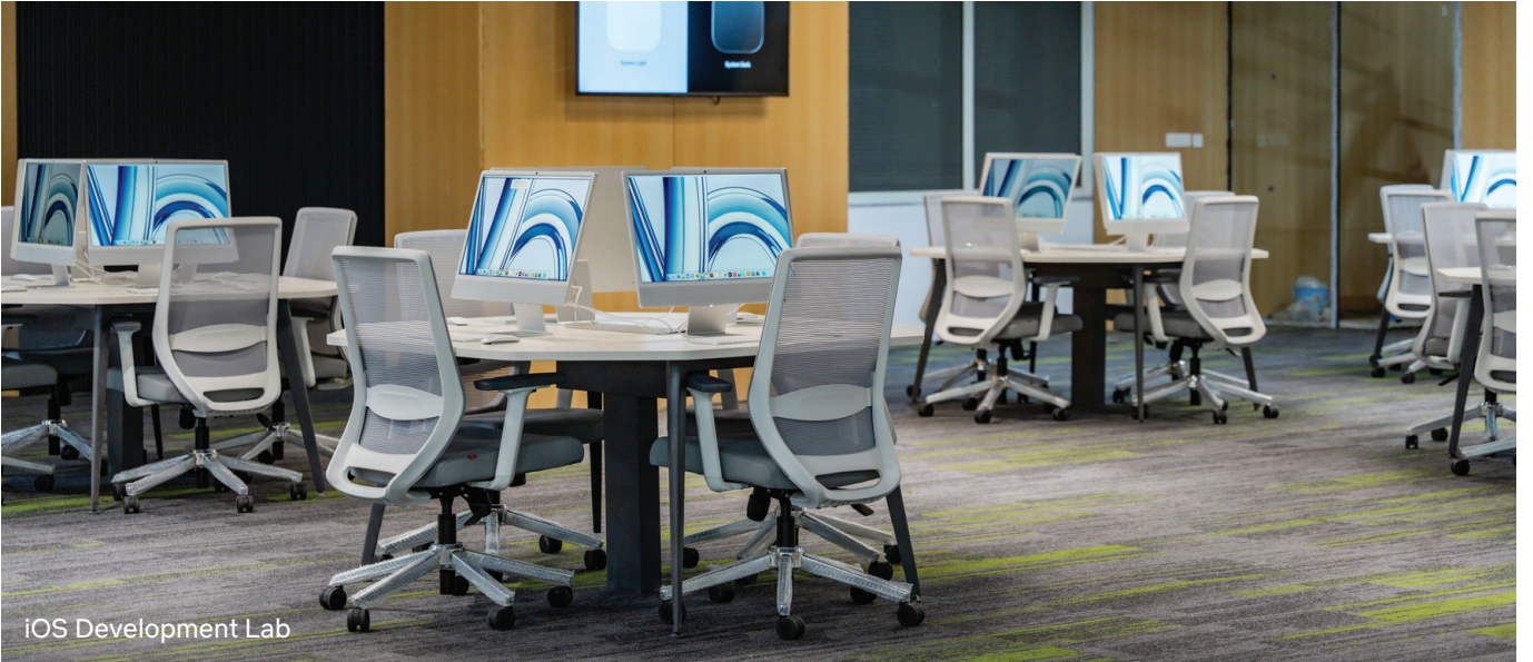
iOS Development Lab